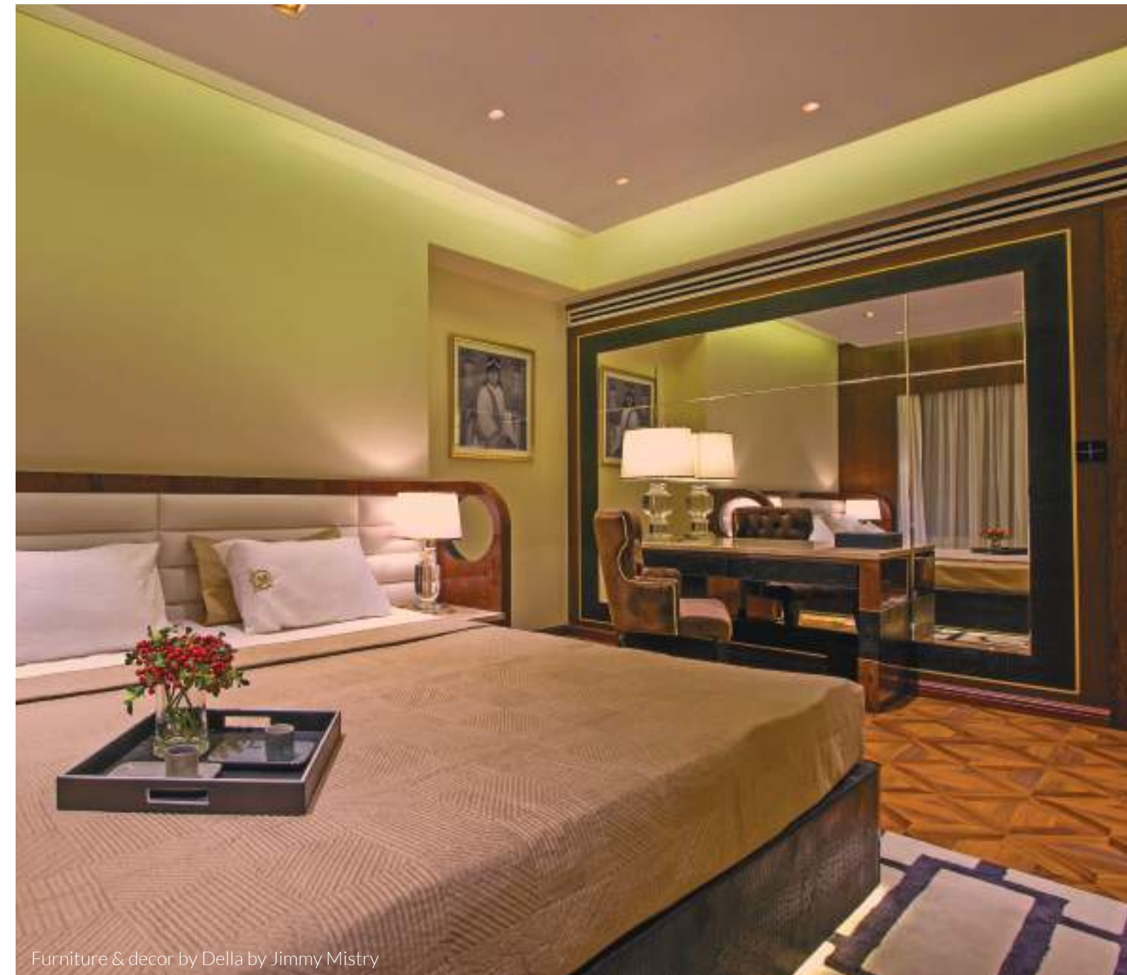
Furniture & decor by Della by Jimmy Mistry