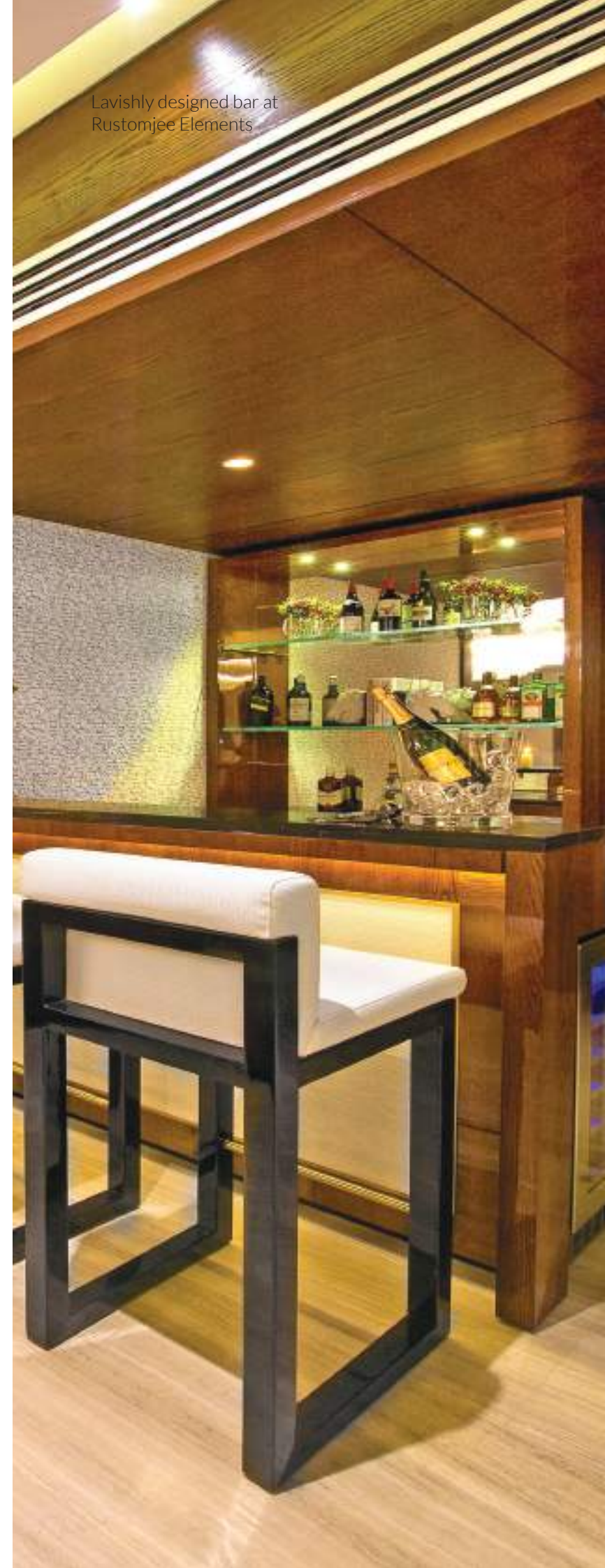
Lavishly designed bar at Rustomjee Elements