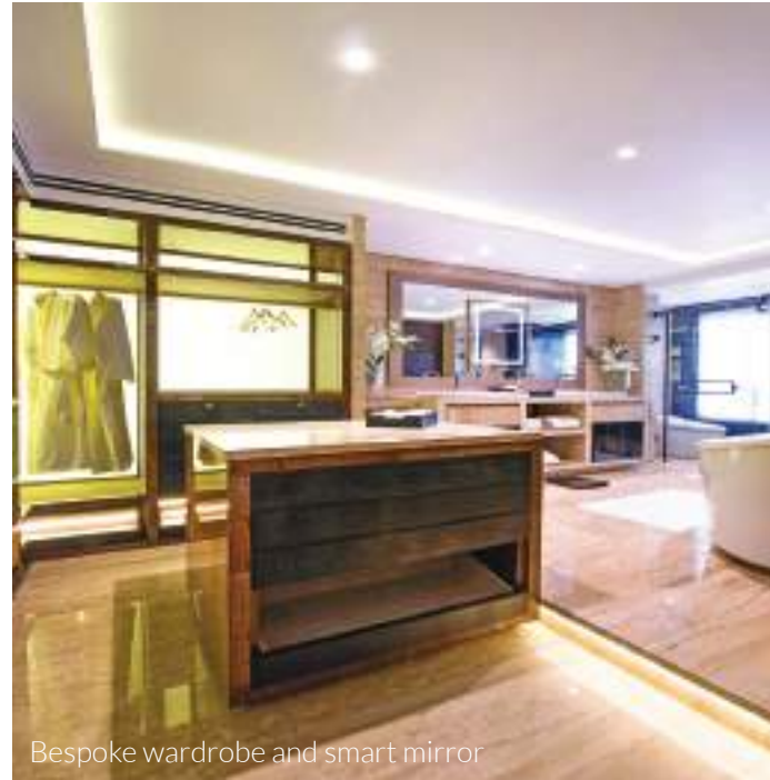
Bespoke wardrobe and smart mirror