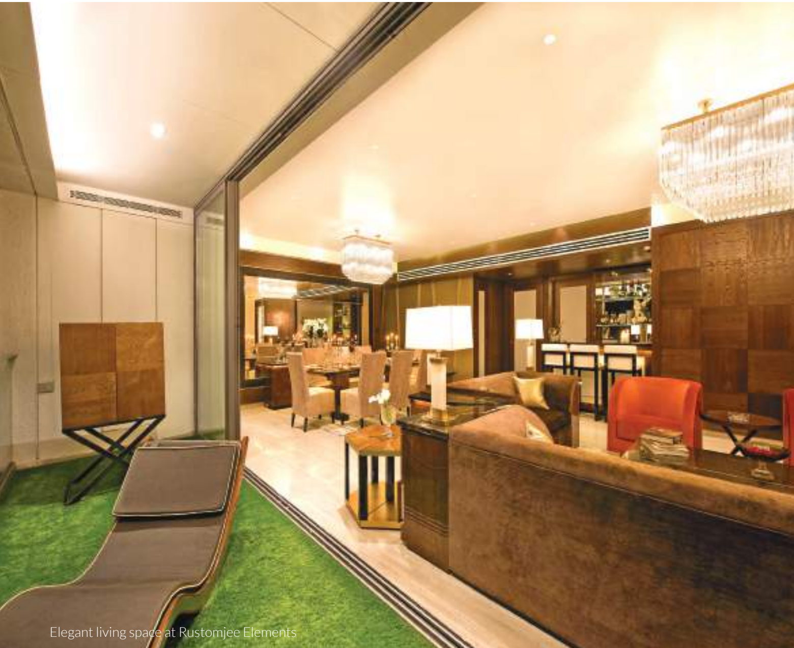
Elegant living space at Rustomjee Elements

“ The entire home is the epitome of a bespoke high tech home that is able to keep up with the dynamic needs of a modern family ”