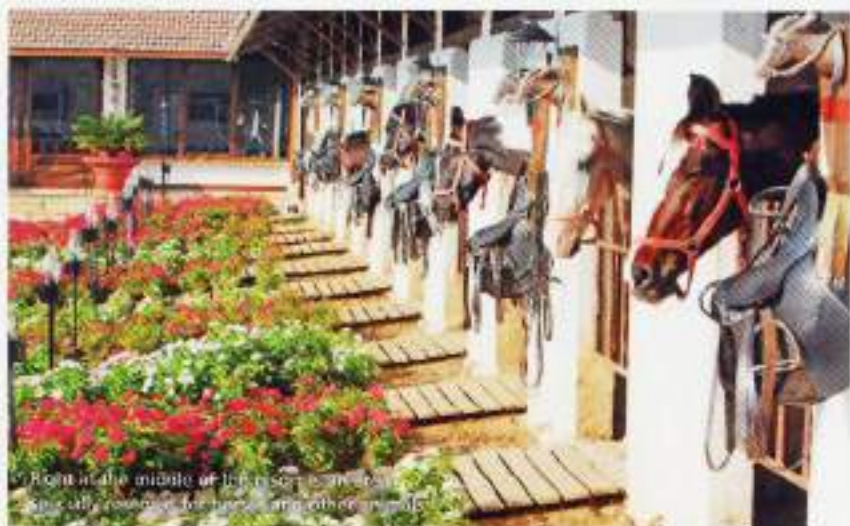
Right in the middle of the resort is reserved for all reasons for dogs and other animals