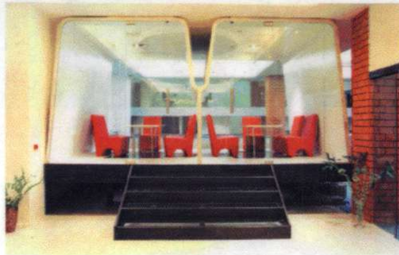
MEETING ROOM, PERCEPT D MARK