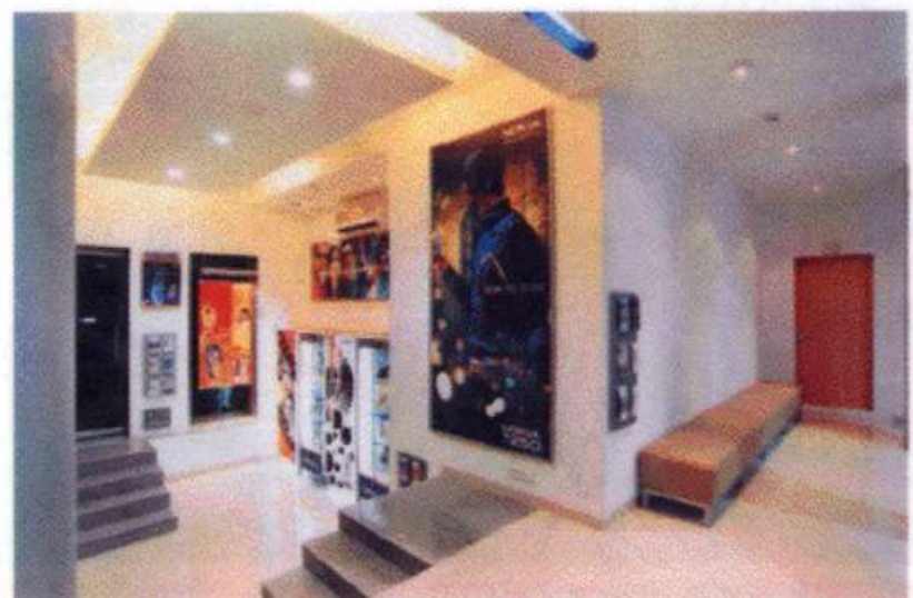
NOKIA PRIORITY CARE CENTER