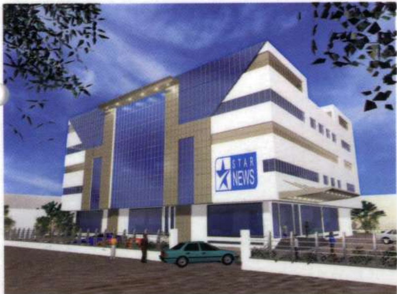
STAR NEWS BUILDING

Even today I feel far more confident going for any