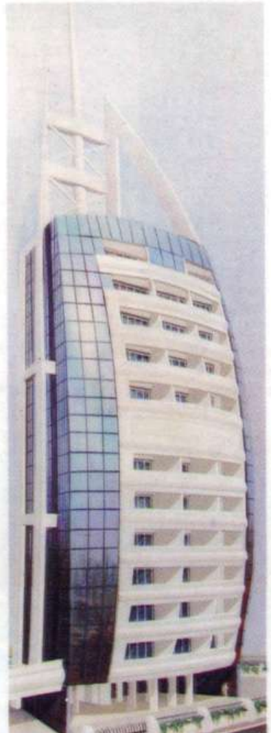
ARCHITECTURAL DESIGN OF A 14 STOREY RESIDENTIAL TOWER IN KHAR, A REPLICA OF BURJ-AL- ARAB