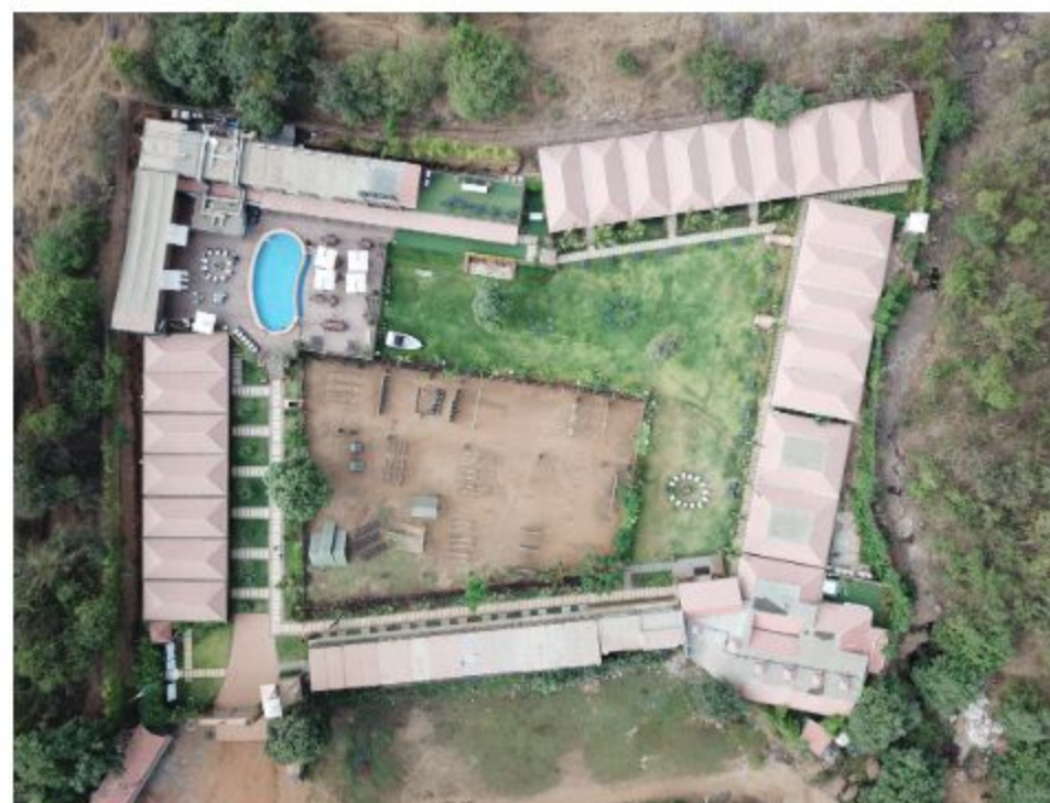
D.A.T.A. Della Adventure Training Academy, Lonavala