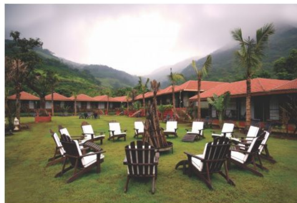
D.A.T.A. Della Adventure Training Academy, Lonavala